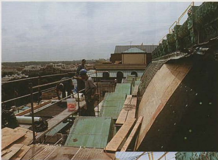
(Left) Tony Tejada installs new pressure-treated plywood to replace the failed concrete deck. The Old Executive Office Building and American Red Cross headquarters can be seen at upper left. (Below) Bob Wooldridge rebuilds the structure that supports the Folger's restored copper cornice.

are extremely deteriorated, and may need to be replaced. Stopping pollutant deterioration and water infiltration at this time is crucial to preserving the front facade of this structure.